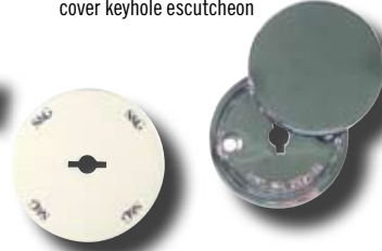
6804-009 Satin nickel finish self-stick keyhole escutcheon