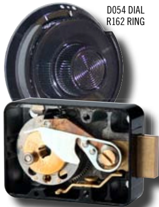
D054 DIAL R162 RING