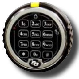
D-DRIVE KEYPAD FOR USE ONLY WITH D-DRIVE LOCKS