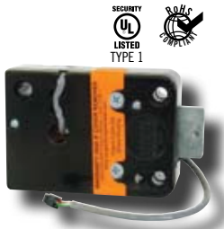
Z 02 D-DRIVE LOCK BODY