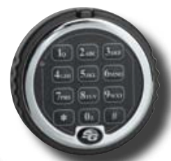
LOW PROFILE KEYPAD