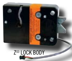
Z 03 LOCK BODY